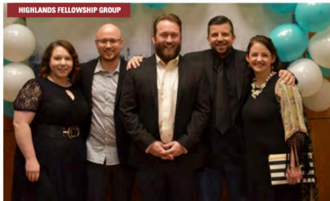
HIGHLANDS FELLOWSHIP GROUP