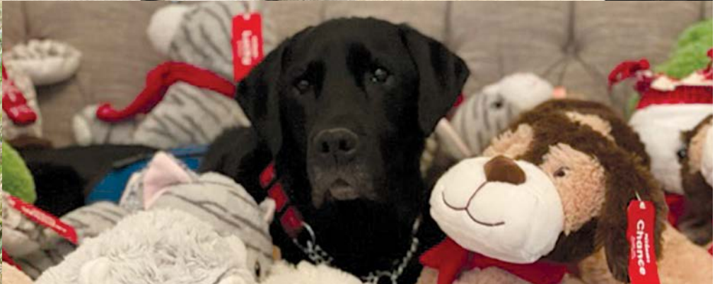
Alpha Certified Facility Dog